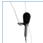
AT0291-L directional microphone with lavalier cord ★★