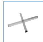
AT0823 speaker table stand