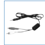
300-6332-107 aux-in cable for external audio (3.5mm–dual RCA)