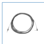
AT0532-15 auxiliary input/ output cable (15ft/4.6m)