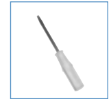
330-3000-101 channel changer screwdriver