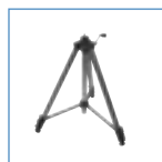
AT0824 speaker floor stand