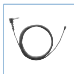
AT0529A transmitter antenna