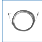
AT0532-05 auxiliary output/ input cable (5ft/1.5m)