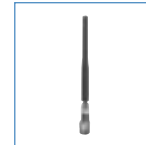
AT0831 920SR speaker antenna