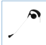
AT0814 earhook microphone ★★★★