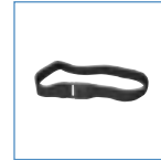
AT0712 921T elastic waist belt