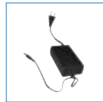
040-7402-106 power supply cord