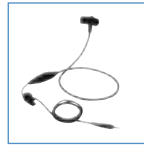
AT0816 FM collar microphone with mute switch ★★★