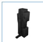
AT0822 carrying bag with shoulder strap