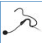
AT0655 behind-the-neck microphone ★★★★