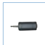
310-2544-1341 aux-out adaptor plug (3.5mm–2.5mm)