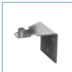
AT0820 wall mounting bracket (set of 2)